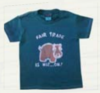
KIDS' SHORT SLEEVE T-SHIRT Ribbed collar. 100% cotton.

Kids' Sizes: XS (2-4), S (6-8), M (10-12) Wholesale: $9.25