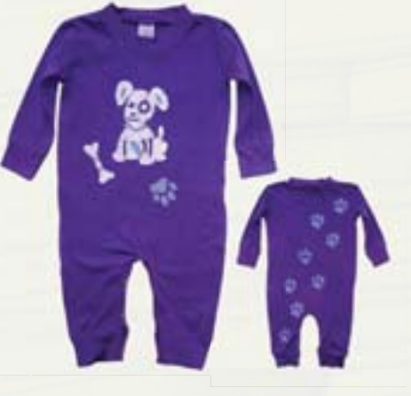
BABIES' LONG SLEEVE ROMPER One-piece outfit. Snaps at legs. Ribbed collar & cuffs. 100% cotton.

Sizes: 6m, 12m, 18m, 24m Wholesale: $11.50