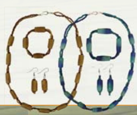
LONG GLASS TUBE Amber, Turquoise/Blue

Wholesale: Necklace: ~22" $8.50 Bracelet: ~7.5" $4.00 Earrings: ~1.75" $3.00