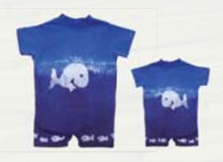
BABIES' SHORT SLEEVE ROMPER T-Shirt top. Snaps at legs. Hemmed legs & sleeves. Ribbed collar. 100% cotton.

Sizes: 6m, 12m, 18m, 24m Wholesale: $10.25