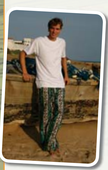
LOUNGE PANT Loose fitting. Elastic waist. 100% cotton.

Sizes: S, M, L, XL, 2X Wholesale: $16.50