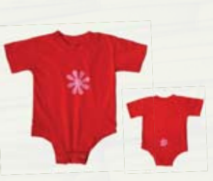
BABIES' T-SHIRT ONESIE T-Shirt top. Snaps at legs. Hemmed sleeves, ribbed collar & leg cuffs. 100% cotton.

Sizes: 6m, 12m, 18m, 24m Wholesale: $10.25