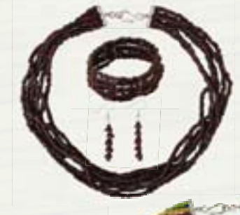
SEEDED DRAPING 6-STRAND Brown/Black, Rainbow, Bauxite (hand cut shaped from bauxite rock) Wholesale: Necklace: ~18" $8.50, Bauxite $12.00 Bracelet: ~7.5" $4.50, Bauxite $7.00