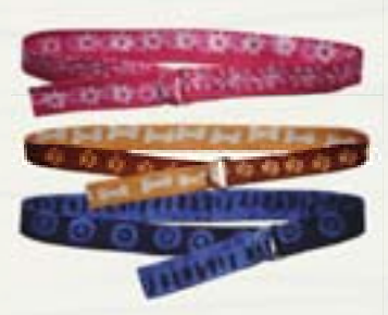
KIDS' HIP BELT Reversible. Polished nickel D-ring closure. Adjustable. 1" width.

Sizes: S (39"), M (45"), L (51") Wholesale: $4.00