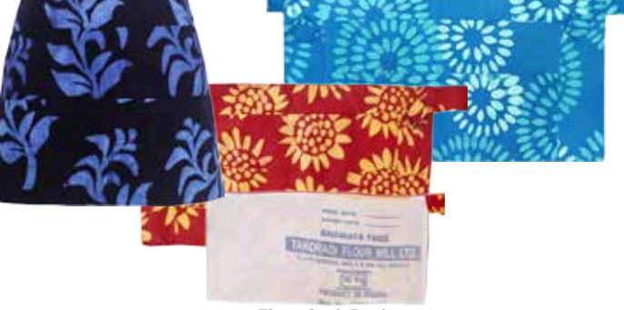
Flour Sack Back

Hanging Ferns-Navy: 45021091 Sunflower-Red: 45021041 Dahlia-Teal: 45021101